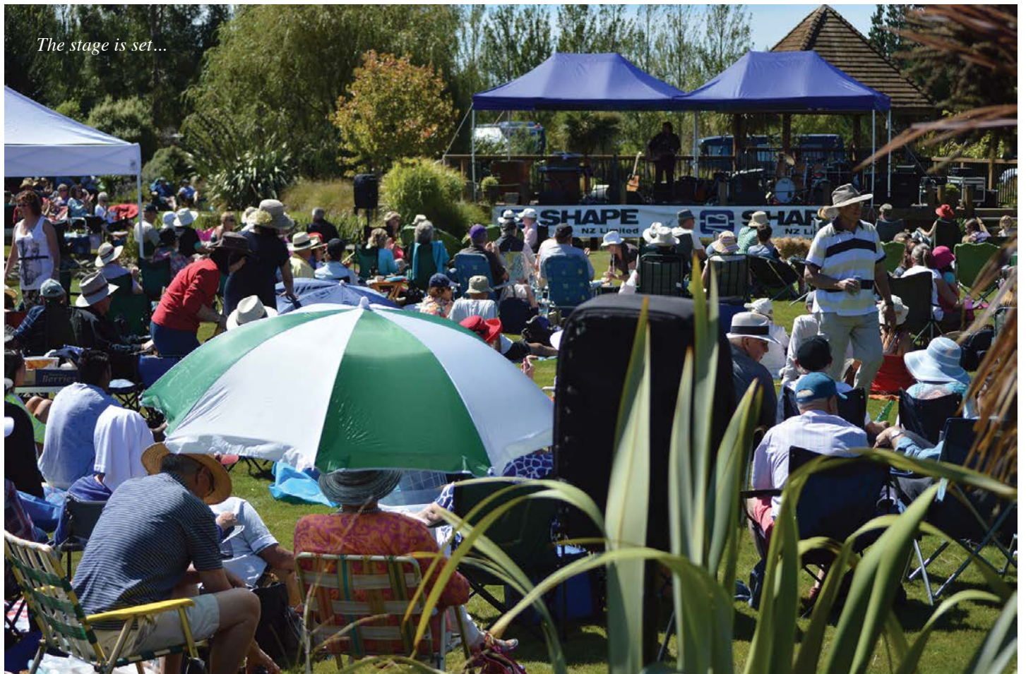
The stage is set...