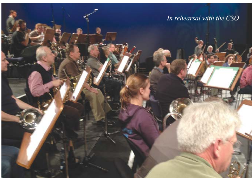
In rehearsal with the CSO