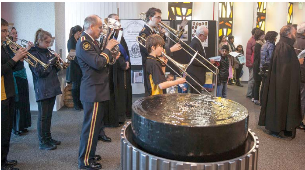
Playing in the church before the procession started