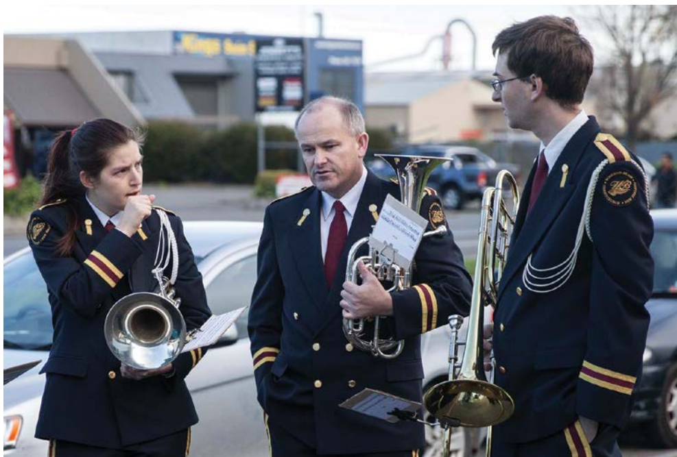
Standing around in a cold wind waiting to start