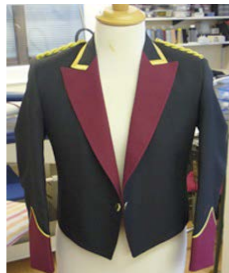
Proposed new uniform

The draft design is very similar to the image below, black jacket, with maroon features and gold detail. Uniforms for the Academy will also be aligned with these branding colours. Once the preferred provider is confirmed, we will gain a quote that will be used to apply for funding, depending on success of applications we hope to have the uniforms made sometime next year.