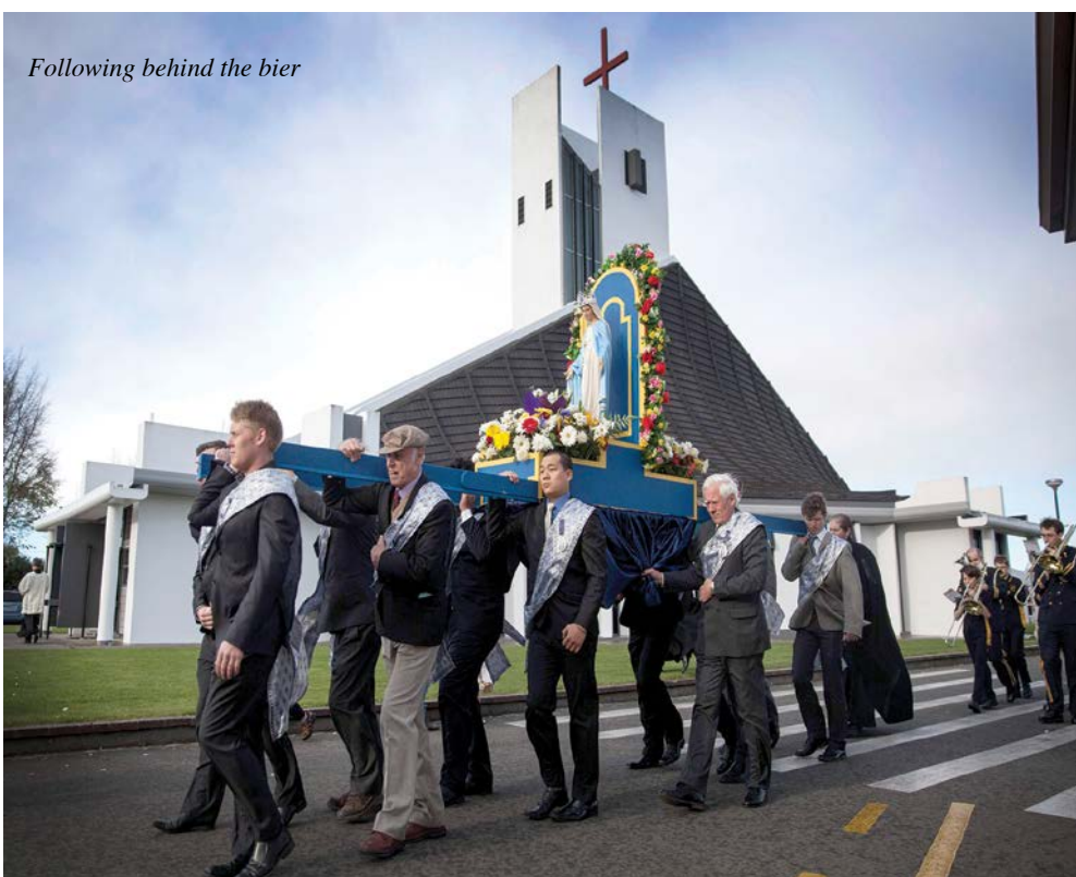
Following behind the bier