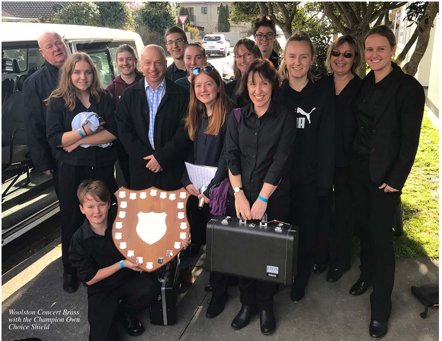
Woolston Concert Brass with the Champion Own Choice Shield