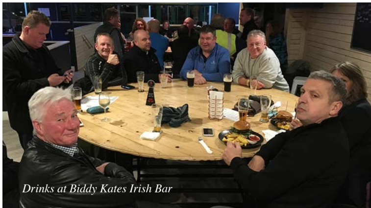
Drinks at Biddy Kates Irish Bar