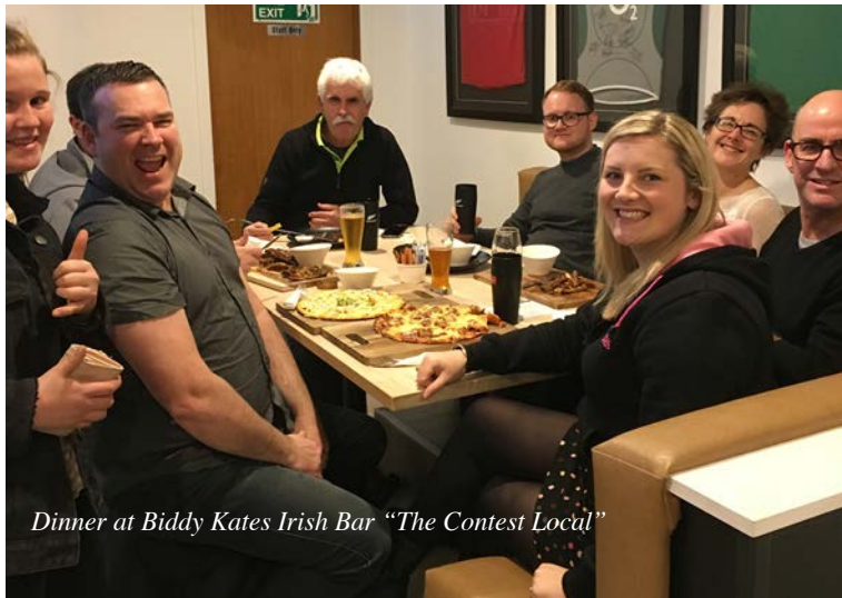
Dinner at Biddy Kates Irish Bar "The Contest Local"